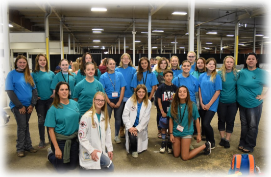
Teams California and District 2 (D2)